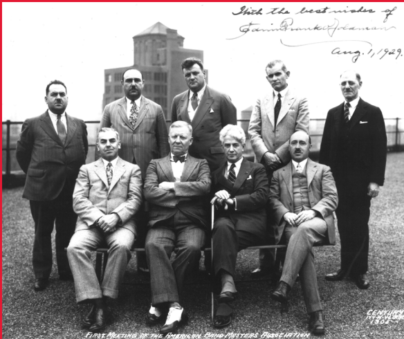
ABA Charter Members at the first meeting in 1929