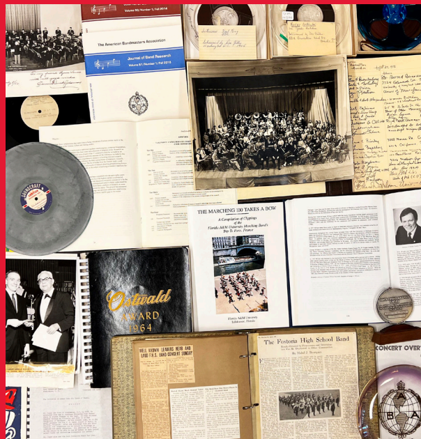
A cross-section of ABA holdings: scrapbooks, programs, photos, records, and a commemorative plate!