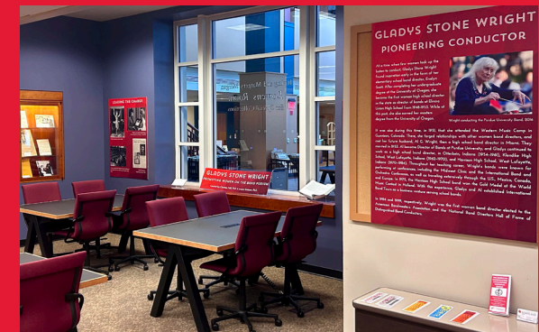
Gladys Stone Wright: Promoting Women on the Band Podium on display in our reading room