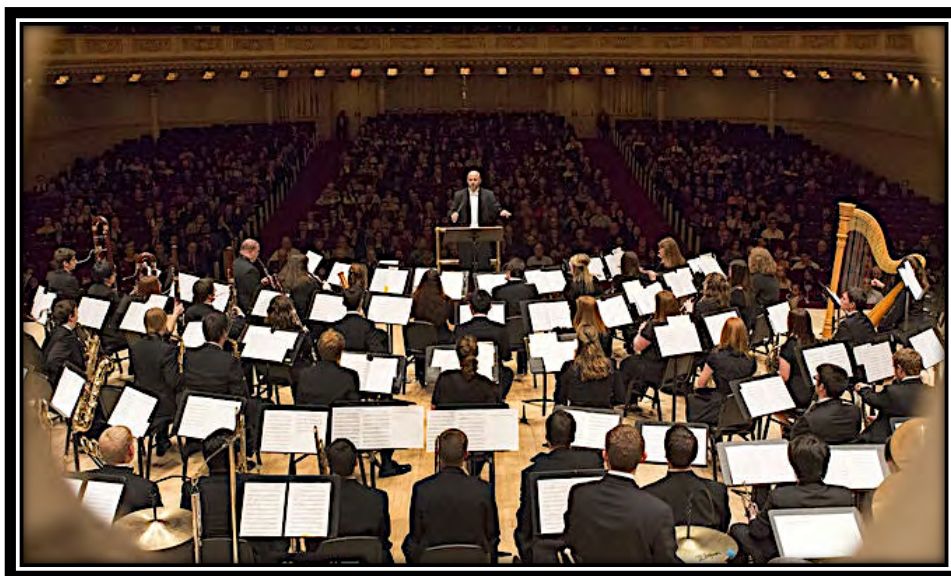
University of Kansas Wind Ensemble